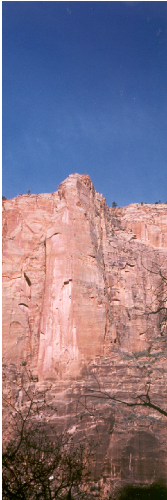
One word: Wow.

Finally, the chains were before me. I grabbed a piece of gear and clipped myself into yet another hanging belay as sound came rushing back into my ears! Feeling like I was