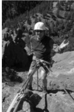
See: you can rappel one-handed!