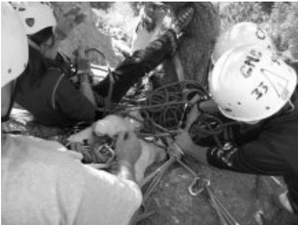
Rope management is one of the many skills learned in BMS...