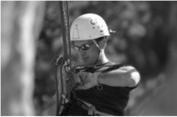
The infamous rappelling past the #*! knot test...