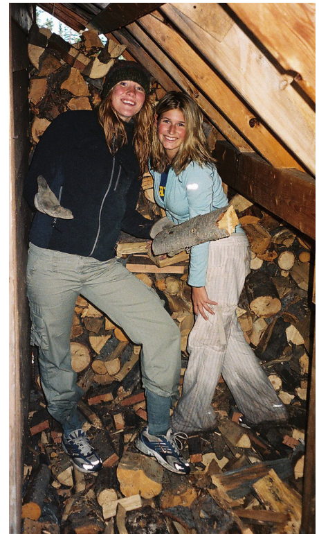
Volunteers work/partying at the Brainard Cabin work party, September 2006