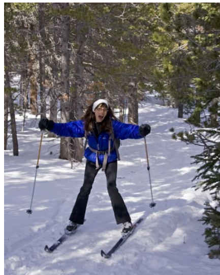
Someone having fun on a CMC ski trip this winter..from the website photo gallery at cmcboulder.org