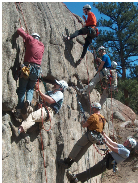
BMS Instructor Rescue Practice at The Dome March 21, 2009

Riviera Top Roping 5.7 Gary Schmidt 970-481-1048 gsch@frii.net