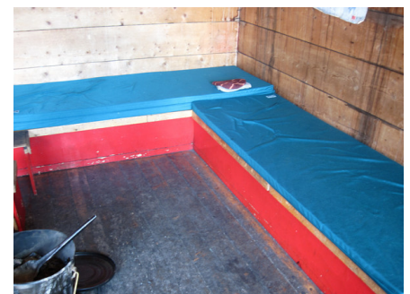
The new sleeping pads guarantee a good night's rest

For those not aware, the Arēstua Hut lies at about 11,000', located about 3 miles west, and 2,000' higher, of the Eldora ski area via USFS trails. The trail starts at the ski area, near the Nordic Center. (The Eldora ski area is not to be confused with the town of Eldora, about two mile north down the main road.) In winter, the trail up to the hut is a challenging, hilly intermediate cross-country ski, or an invigorating snowshoe hike, through dense forest on a well marked trail.